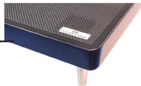
CARBON FIBER / KEVLAR / KRION MULTILAYER PLATFORM